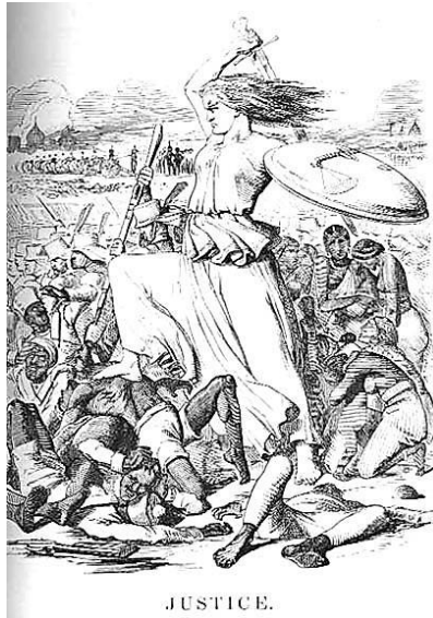
Figure 1. "Justice," political cartoon, Punch magazine, 12 Sept. 1857, 109.