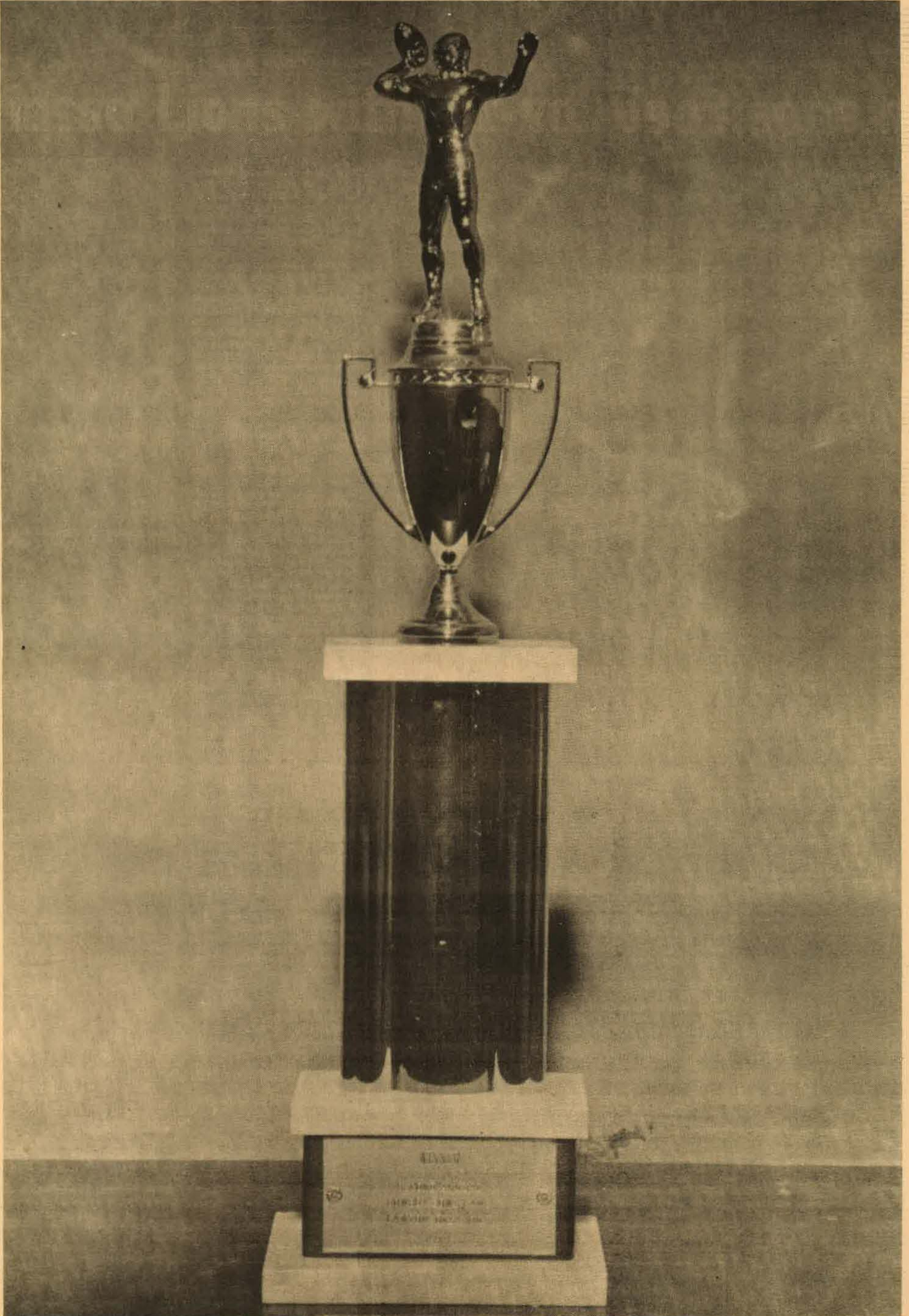
AIC co-champions and now. . .