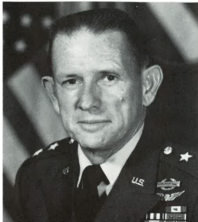
Maj. Gen. John Singlaub

A high-ranking army officer, two former United States federal administrators and a television news correspondent will headline the 1978-79 lecture series of the American Studies Program at Harding in the Main Auditorium.