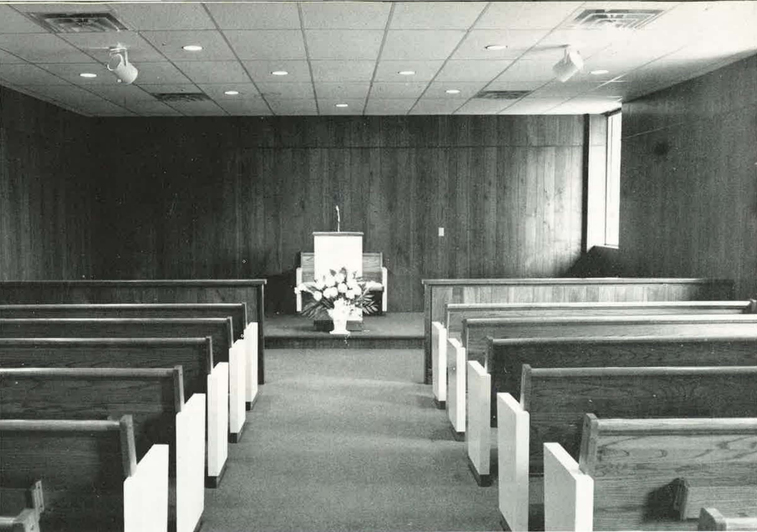
Conceived as a place for private meditations and devotionals, the Shores Memorial Chapel is a distinctive facility in the Hammon Student Center.