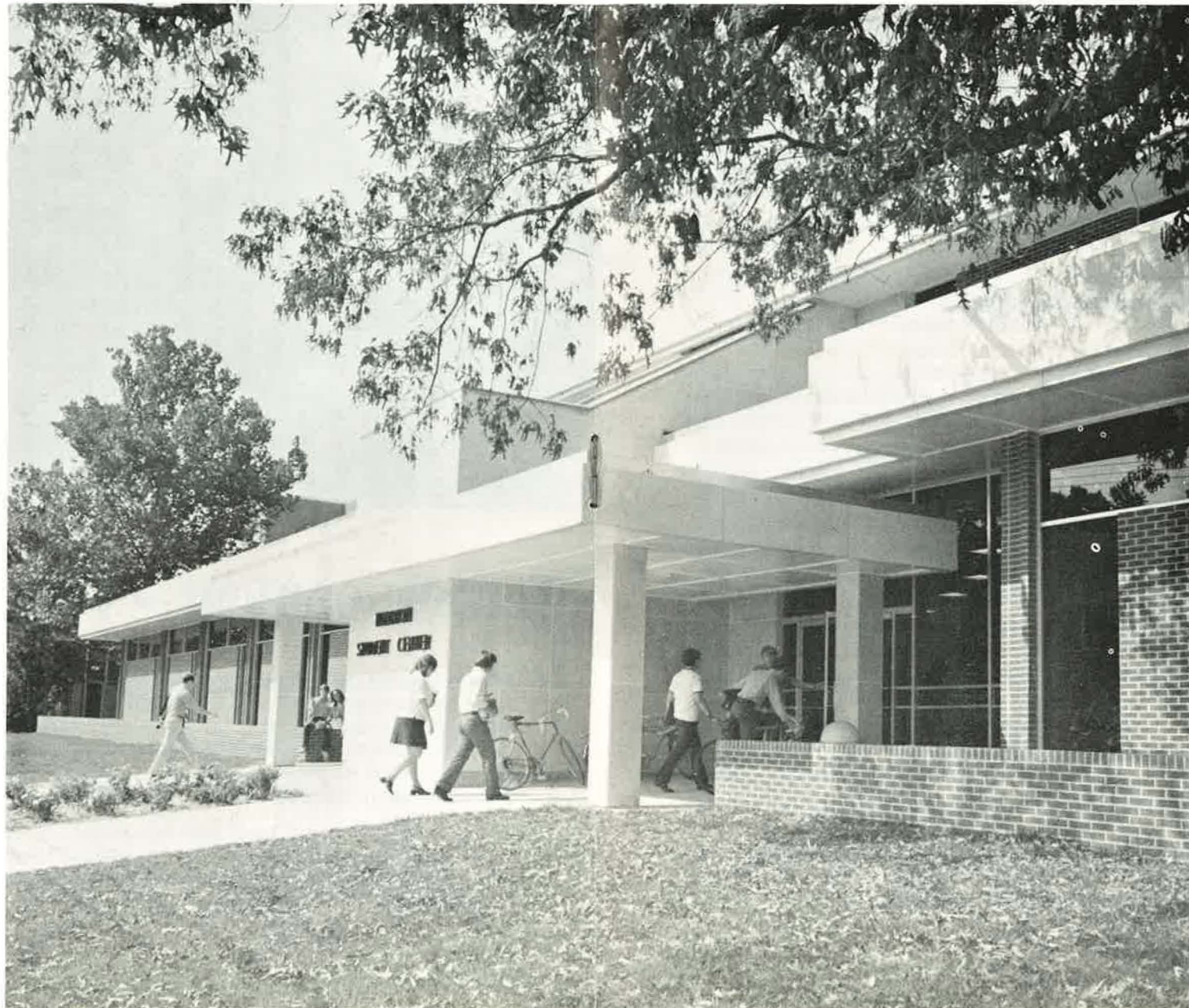
Located east of the American Heritage Center, the Hammon Student Center is already the social hub of the college campus.