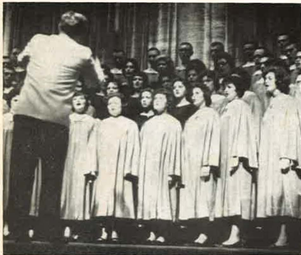
One of Six Musical Groups Appearing on Last Year's Program