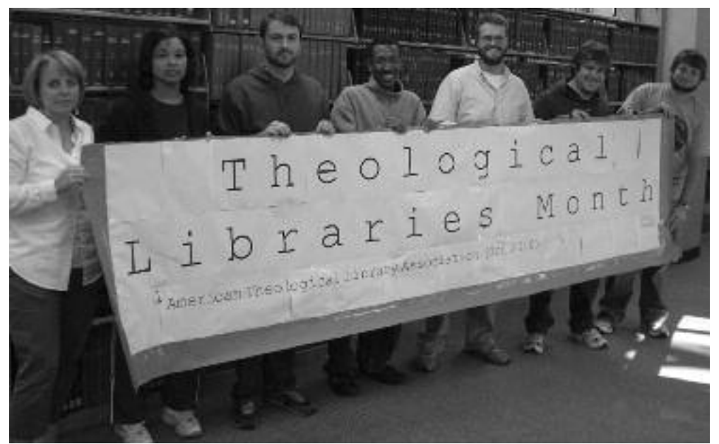
Students join in during the weeklong celebration of Theological Libraries Month.