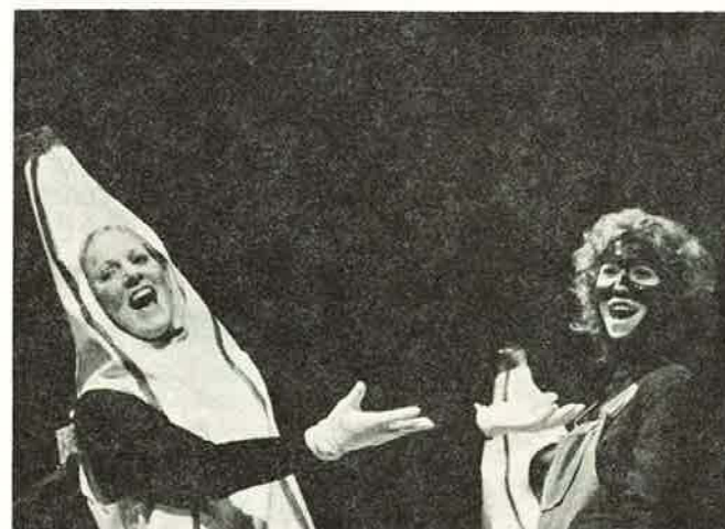
Representing Kappa Phi and Omega Phi, members show that monkeys can "Go Bananas."