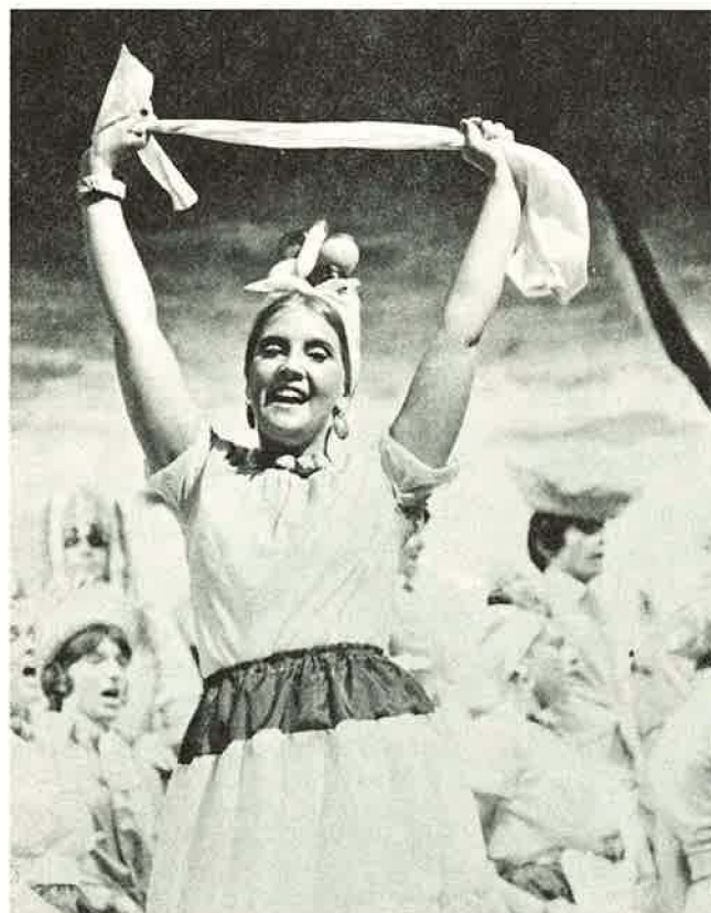
Songs of the South Seas and colorful costumes take the audience with Kappa Kappa and Kappa Sigma Kappa on an island retreat in "Calypso."