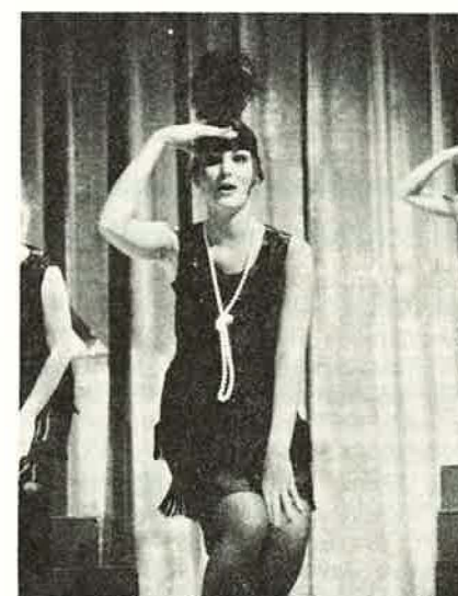
Shantih members ask, "Ain't He Sweet?" in their Roaring Twenties revue.