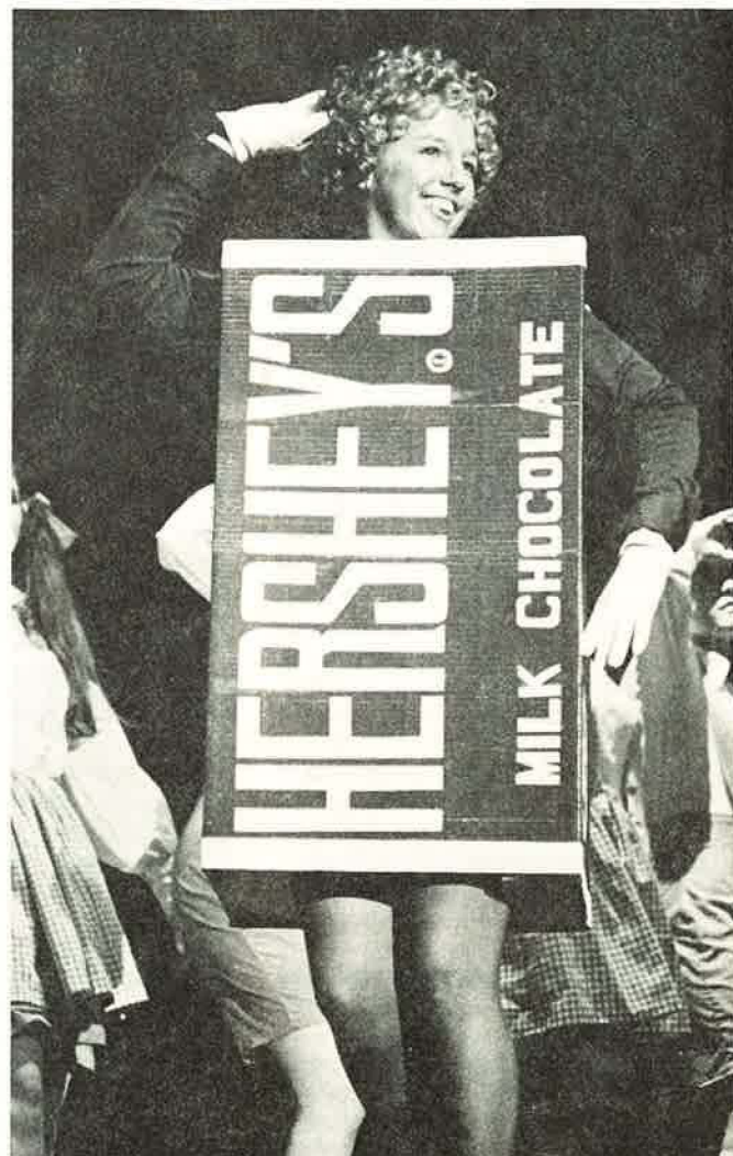
Miss Hershey's arrival in Kappa Delta's "Sugar Baby Gang" precedes the appearance of deadly Mr. Tooth Decay.