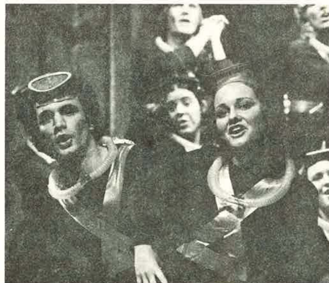
Mohican and Zeta Phi Zeta members go underneath the sea as frogmen to present "Octopus' Garden."