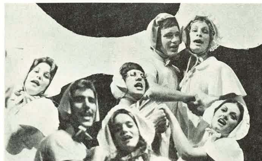
Sub T-16 and Ko Jo Kai members don pink and blue bonnets and reminisce on the days of diaperhood as they perform "Little Bitty Baby Bumpers."