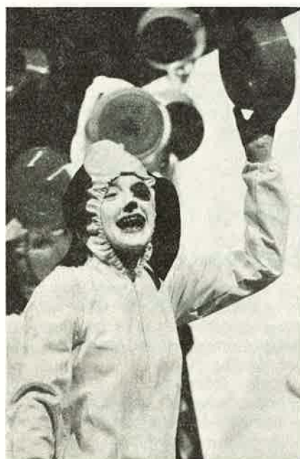
Inspired by the Peanuts character Snoopy, Zeta Rho and TNT show that "It's A Dog's Life."