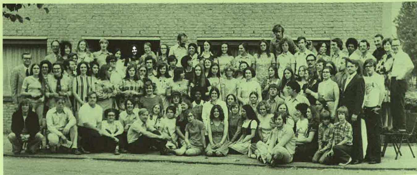
These 78 campaign workers spent six weeks in European evangelistic endeavors in five countries.