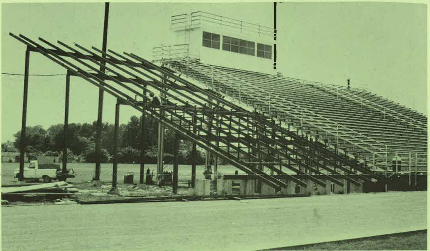
The new section of metal stands at Alumni Football Field is nearing completion and is expected to be ready in time for the first home game, Sept. 15. The additional seating facilities, sponsored under the direction of Searcy's Downtown Bison Boosters, will increase the stadium's seating capacity to approximately 4,300. A new, permanent concession stand is also under construction.