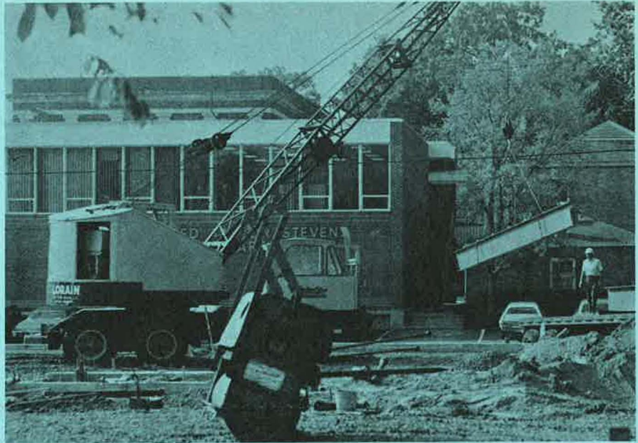
Workmen unload steel girders which will be used in the construction of the new $850,000 student center. Construction is expected to be completed by the fall semester of 1973.

Advance information or reservations may be obtained by writing the Harding College Alumni Association, Searcy, Arkansas 72143. A ticket reservation order form may be found on page 4 of this publication.