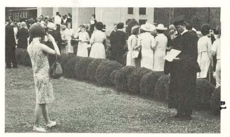
A new alumnus gets his picture taken on Graduation Day.