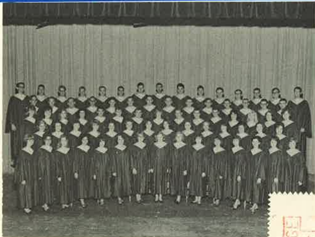
THE HARDING A CAPPELLA CHORUS, directed by Kennet is one of the six campus musical groups who will prescerts at 7:00 o'clock nightly before the evening lectures.