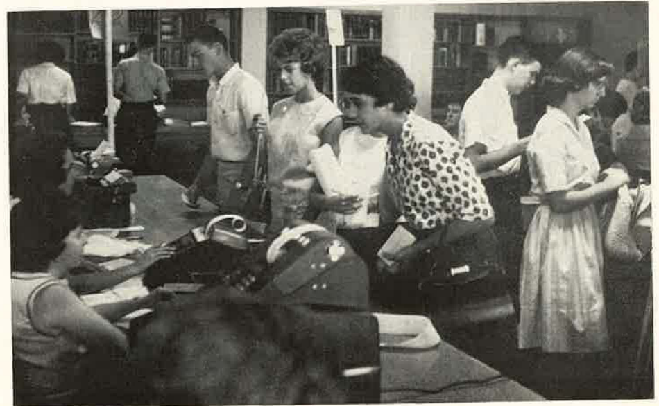
The latest count of 1964 registrants showed that 1200 walked through the registration lines September 9 and 10.