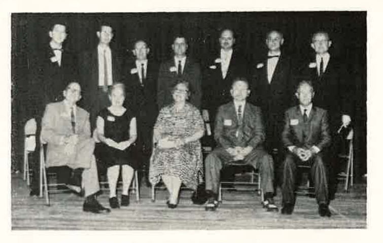
Members of Class of '37 Present