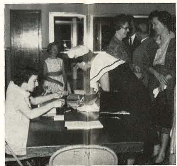
Some Registered Early and Stayed Late