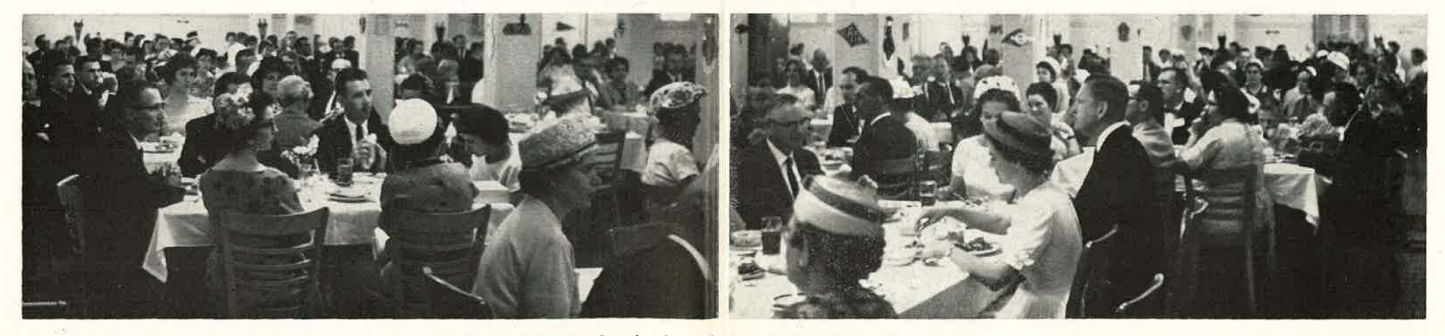
A Total of 325 Were Served at Annual Luncheon in Dining Hall on Graduation Day