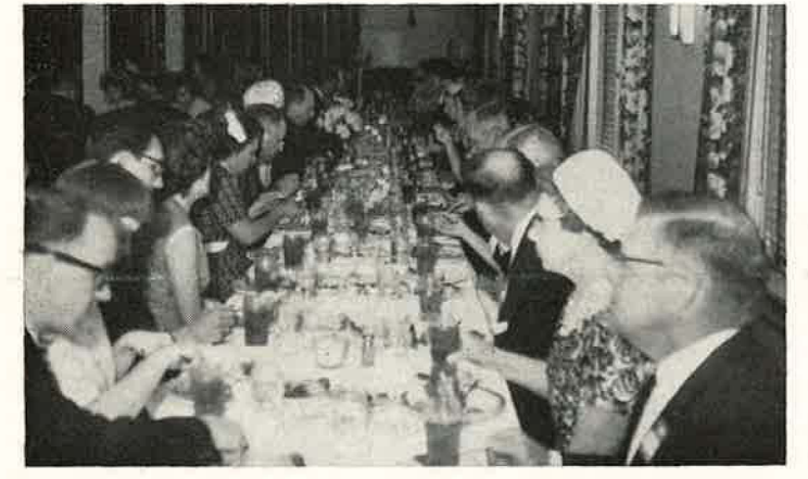
One of Many Tables at Reunion Luncheon