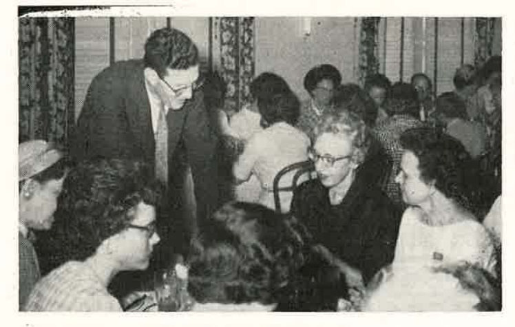
Tales by Bales at Reunion Luncheon