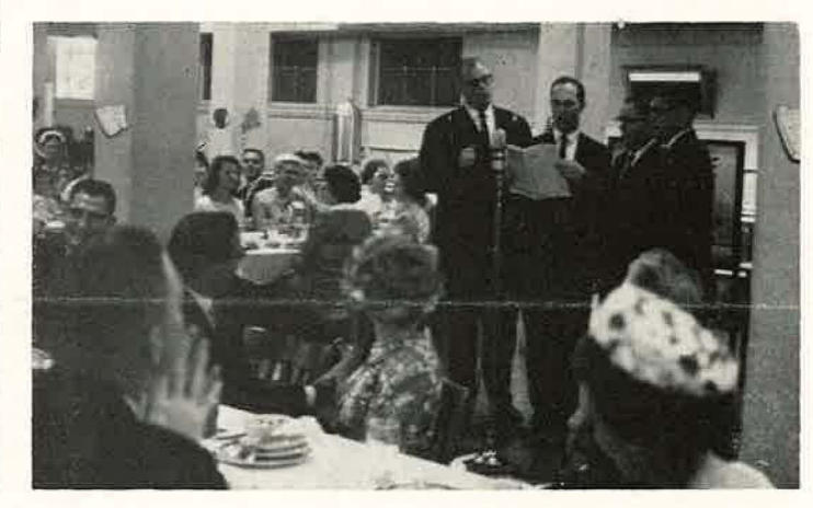
A Quartet of Alumni Entertain