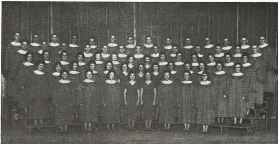
The Harding College A Cappella Chorus

If you know someone with a nearby station, or feel you could get a station interested in broadcasting the program, you or the station may write to Hymns from Harding, Station A, Box 586, Searcy, Arkansas. We will send information and an audition tape if they should want to consider the program.