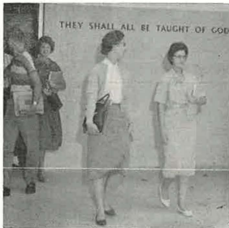
The Aim of Christian Education

When the class of '60 graduated, a good percentage of them made a similar pledge and left it on file in the Alumni