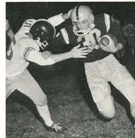
Action at Mississippi College

Possibly in the eyes of casual spectators the season looked gloomy with only one win in six games, but pre-season expectations of coaches and close observers were actually exceeded in the single victory over Arkansas State's freshmen.