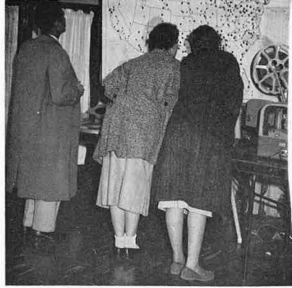
Many Interesting Exhibits

Game time is 4:00 o'clock, when the improved Bisons expect to meet a much improved John Brown team. Last year, the Lectureship crowd thrilled to a close Bison victory of 68-66 over the Arkansas College Scots.