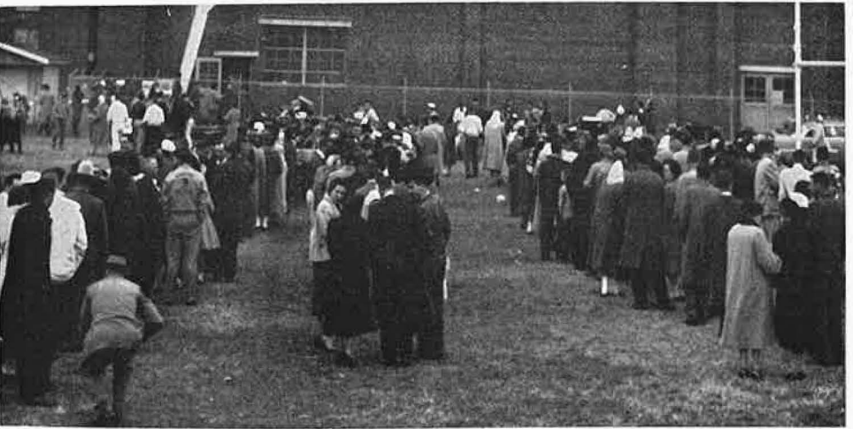
Thousands will be fed at free Thanksgiving barbecue.