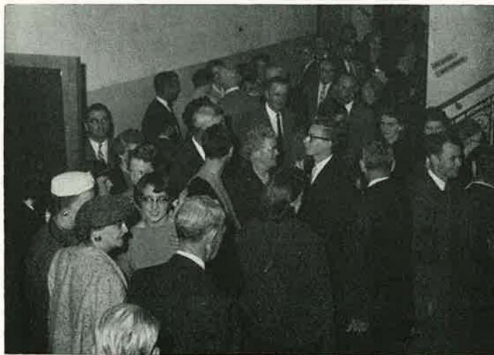
Lectureships offer many fellowship opportunities.

Another important feature of the Lectureship is the group of interesting exhibits and displays. These are largely made up of methods and materials to assist churches and Bible schools, reports on mission fields and opportunities, and general efforts like the Herald of Truth.