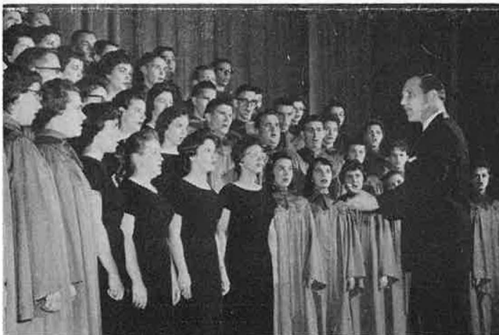
The Harding College A Cappella Chorus, on Thursday evening before departure on its annual fall tour, will present a concert for all Lectureship visitors. Other Harding musical groups will begin the evening programs on Monday, Tuesday and Wednesday.