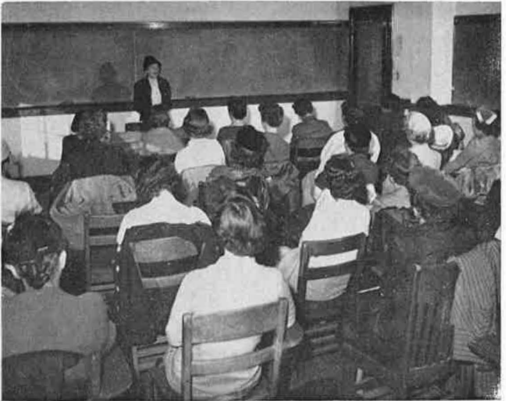
Christian workers can build abilities through classes.

Each panel session will close with a question period in which the audience may direct questions to individual panel members as long as time permits.