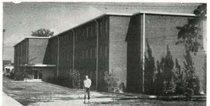
Graduate Hall for men is handy to everything.