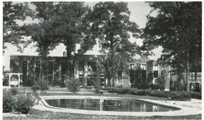
Beaumont Memorial Library, faces afternoon sun.