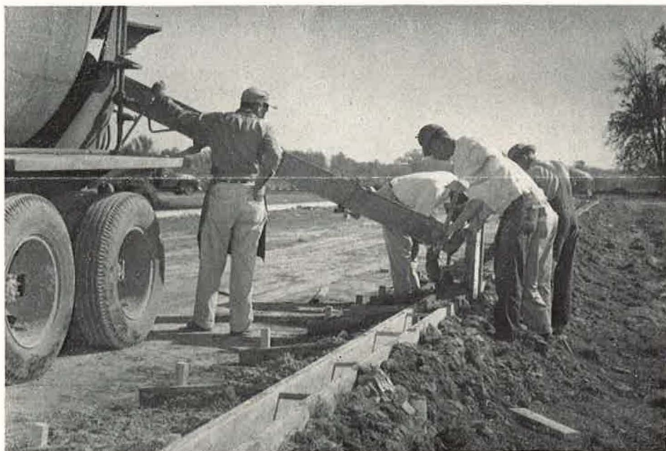
Workmen pour concrete at the site of the new athletic field. In the background can be seen part of the completed curb which rings the eight-lane quarter-of-a-mile track.