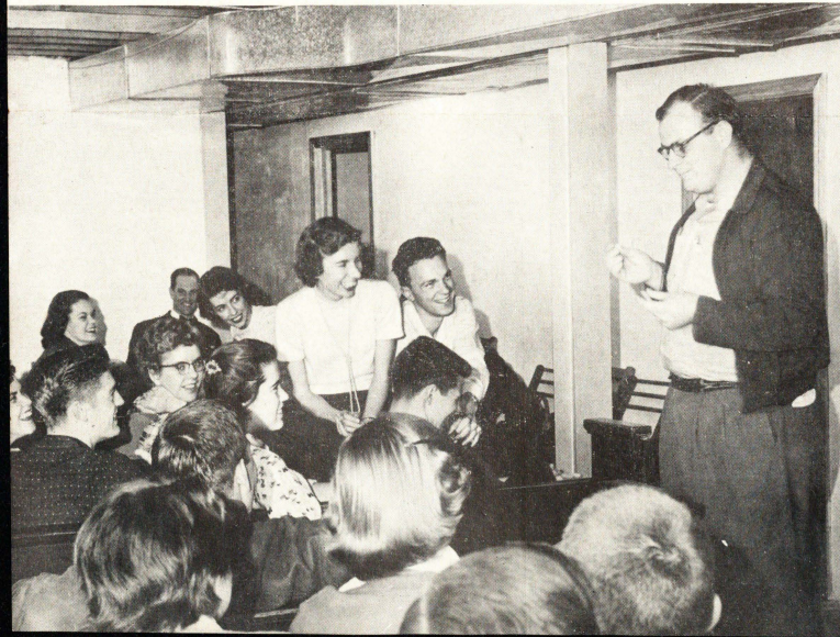
◀ Waiting in church basement before time to go on, group is entertained by singer's story of "eensie, teensie, little bird."