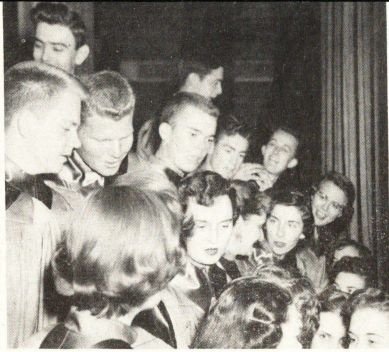
◀ New robes arrived in time to be taken on trip, were tried at pre-tour performance. Different colored collars of red, white, and purple, surprised, pleased audiences.