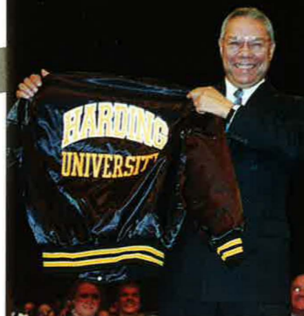
After his speech, Secretary of State Colin Powell displays his new Harding jacket to a delighted capacity audience.

Secretary of State Colin Powell's presentation in October drew a record-breaking crowd in Benson Auditorium with simultaneous broadcasts via closed circuit television to the Carter and Heritage auditoriums. He identified education as one of the top priorities for the nation and shared his vision for