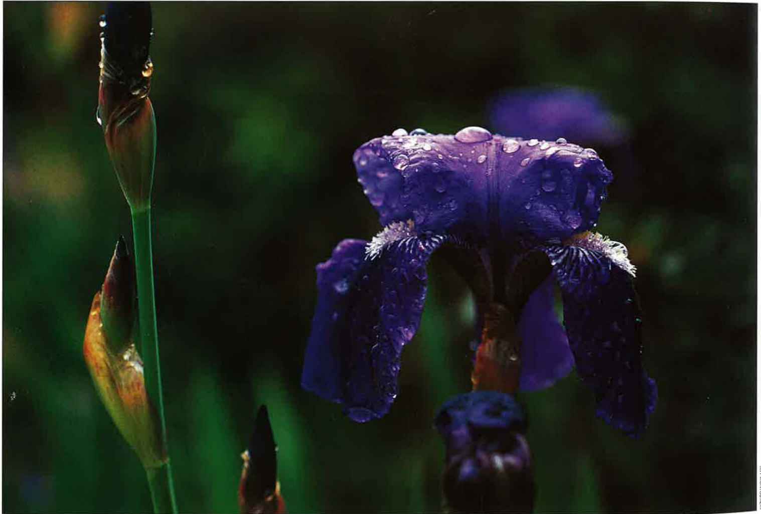
The showy flowers of the iris combine with hundreds of dogwoods and azaleas to brighten the campus this spring.