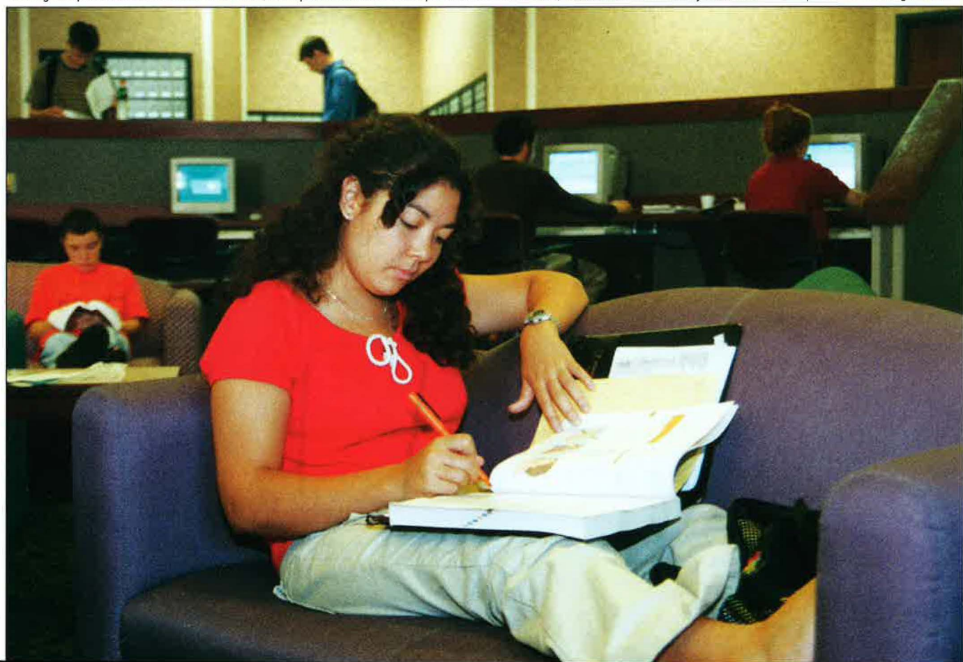
Utilizing the space where Bison Lanes once stood, the expanded Student Center provides more mailboxes, couches on which to study and relax, and computers for checking e-mail.

Submit your alumni news to "Connections," Harding University Office of Alumni Relations, Box 10768, Searcy, AR 72149-0001; or by e-mail to alumni-news@harding.edu. To subscribe to the weekly e-mail listserv Alumni Digest, send message to subscribe, including your name and class year, to alumni-list@harding.edu. You may post messages to the Digest at the same address.