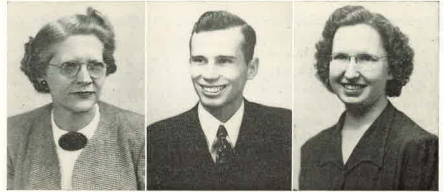
ALPHA HONOR SOCIETY