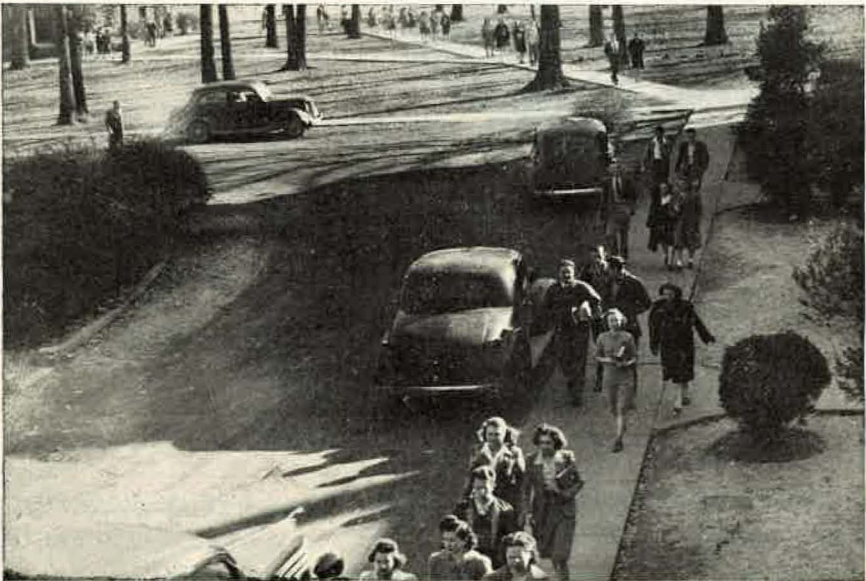
GOING FROM DAILY CHAPEL TO CLASSES