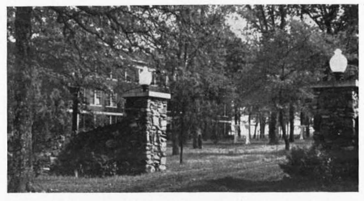
Where the Bible Is Taught as the Inspired Word of God

"Your communication of January 27th comes like a breath of fresh air through thick smoke. I congratulate you on your determination to give your students the opportunity of learning something about business from the men who are actually engaged in it."