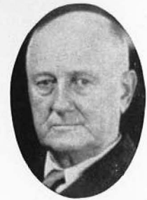
GEN. J. G. HARBORD

Chairman of the Board, Radio Corporation of America