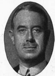
ROBERT R. McCORMICK Publisher of The Chicago Tribune, One of the World's Largest Newspapers

"Your splendid example of instilling in your students allegiance to those principles which have guided us, heretofore, in political and economic development could well be imitated by the heads of other educational institutions. I am sure that under your guidance, your college will develop good American citizens."