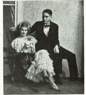
Scene from Booth Tarkington's "Seventeen"

Every phase of speech and dramatic training is given from acting to creating scenery and writing plays. Harding is the first college in the state to make a corrective and cultural speech course a requirement for every student. It has received high commendations from educational leaders for its progressive work, and at least one other institution of outstanding position is planning to follow its policy as rapidly as it can be arranged.